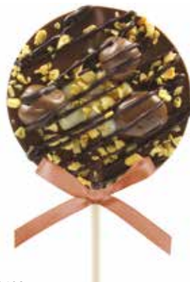
GC402 BC: 5060352657937 24 x 50g TOFFEE CRUNCH (M)