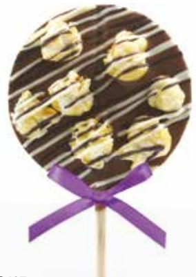
GC407 BC: 5060352657982 24 x 50g TOFFEE-TASTIC (M)

(M) Milk Chocolate / (D) Dark Chocolate / (W) White Chocolate