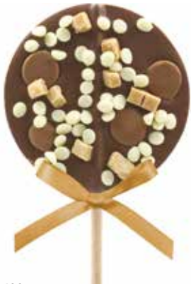
GC400 BC: 5060352657913 24 x 50g CARMEL SURPRISE (M)