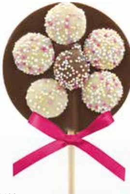
GC406 BC: 5060352657975 24 x 50g JAZZIE POP (M)