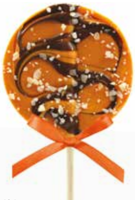
GC404 BC: 5060352657951 24 x 50g ORANGE POPPING CANDY (M)