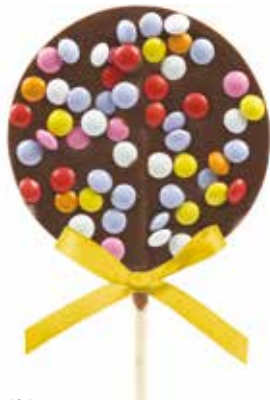
GC401 BC: 5060352657920 24 x 50g SMART-TASTIC (M)