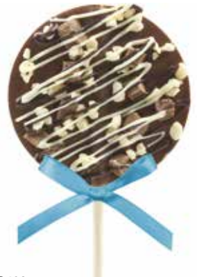
GC403 BC: 5060352657944 24 x 50g FUDGYLICIOUS BROWNIE (M)