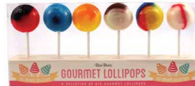
GL001 Barcode: 5060352655223 12 x 120g