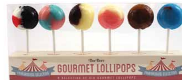
GL003 Barcode: 5060352655247 12 x 120g