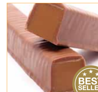
BF400 Barcode: 5060352653731 21 x 100g

Our range of chocolate dipped Fudge fingers are a truly indulgent treat. Each delicious variety is packed in its own distinctive shelf-ready display box, making them easy to pick up and after one bite, hard to put down!