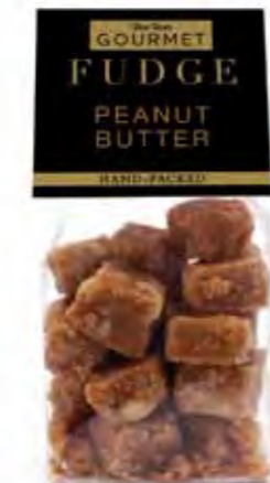
BF308 Barcode: 5060247763088 12 x 150g