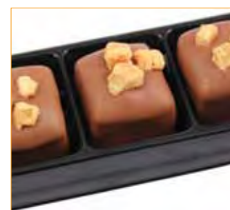
BF503 Barcode: 5060352653823 15 x 80g