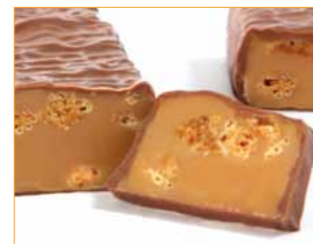
BF603 Barcode: 5060352654318 13 x 200g