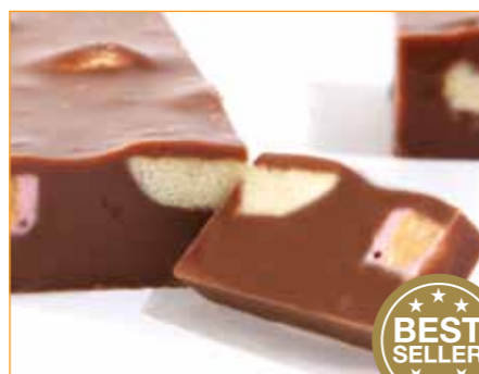
BF602 Barcode: 5060352654301 13 x 200g