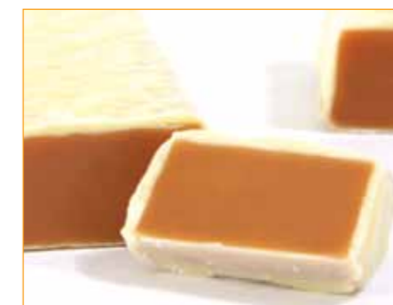
BF604 Barcode: 5060352654325 13 x 200g

WHITE CHOCOLATE COVERED IRISH CREAM LIQUEUR