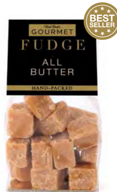
BF300 Barcode: 5060247763002 12 x 150g