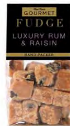
BF306 Barcode: 5060247763064 12 x 150g