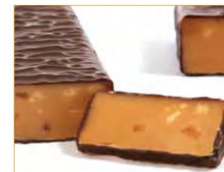
BF607 Barcode: 5060352654349 13 x 200g

WHITE CHOCOLATE COVERED IRISH CREAM LIQUEUR