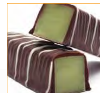
BF405 Barcode: 5060352653786 21 x 100g