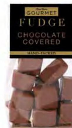
BF303 Barcode: 5060247763033 12 x 150g