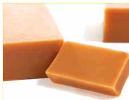
BF600 Barcode: 5060352654295 13 x 200g