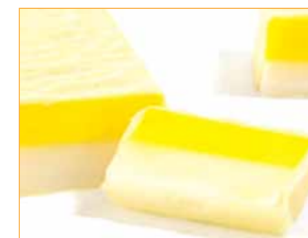
BF605 Barcode: 5060352654332 13 x 200g

WHITE CHOCOLATE COVERED TRIPLE CHOCOLATE DELIGHT