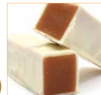
BF401 Barcode: 5060352653748 21 x 100g