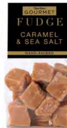
BF301 Barcode: 5060247763019 12 x 150g