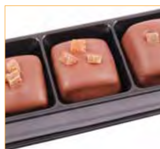
BF505 Barcode: 5060352653847 15 x 80g