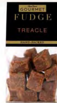
BF304 Barcode: 5060247763040 12 x 150g