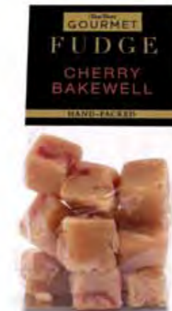
BF309 Barcode: 5060247763095 12 x 150g