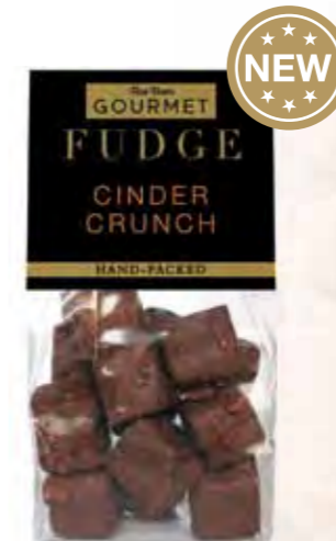
BF314 Barcode: 5060352656060 12 x 150g