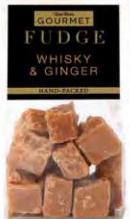
BF305 Barcode: 5060247763057 12 x 150g