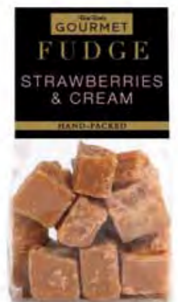
BF313 Barcode: 5060352653687 12 x 150g